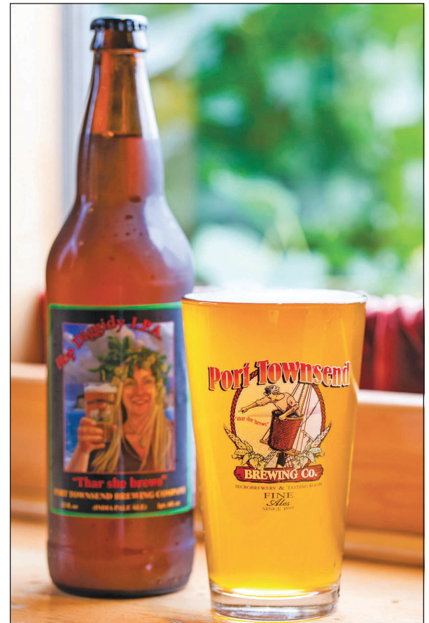
The Port Townsend Brewing Company currently brews more than 10 of its own signature ales.

For more information about the Port Townsend Brewing Company, including its online store, visit www.porttownsend-brewing.com .