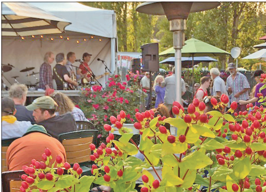
Live music is featured year-round at the Port Townsend Brewing Company and can be enjoyed in its outdoor beer garden in the summertime.