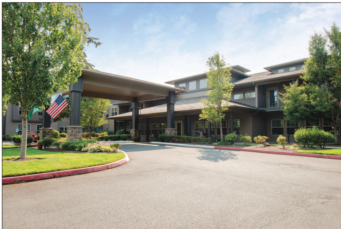
Avamere at Port Townsend, an independent and assisted senior living facility, includes 54 independent living apartments that are available in both one and two bedrooms, as well as studio and one bedroom assisted living apartments.

Learn more about Avamere at Port of Townsend at AvamereAtPortTownsend.com .